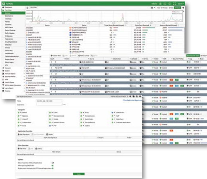
FortiOS Management UI – FortiView, Policy Table and Application Control Panel